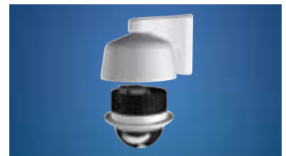
Versatile Design Makes Installation Fast & Easy

The Spectra Mini Data Port, standard with every system, greatly saves time by letting you update and program your Spectra Mini via the Remote Monitor Kit and Remote Monitor Cable. These accessories allow the installer to view video, control PTZ and perform system setup and software upgrades at the installation site.