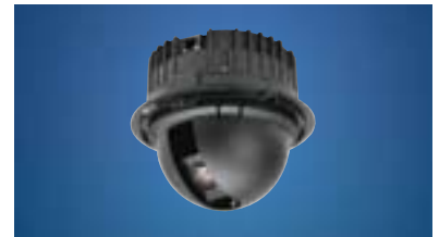
Choose from a Variety of Mounting Options