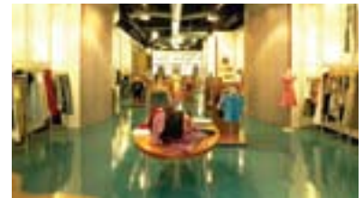
The Smart Choice for Indoor Applications

Similar in size to Pelco Camclosure Fixed Dome Systems, Spectra Mini's all-in-one design provides a discreet presence for any indoor application. Combining the features of a traditional high-speed dome into a small package, Spectra Mini can also be used in concert with Pelco Camclosure Fixed Dome Systems to provide a consistent, discreet and attractive look throughout any facility.