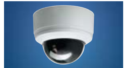
Professional Level, Network Based Video