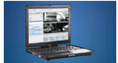
View and Control Through Web Browser