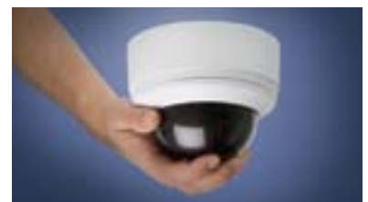
Compact Design. Big System Performance