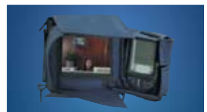
Remote Monitor Kit for Set Up and Control