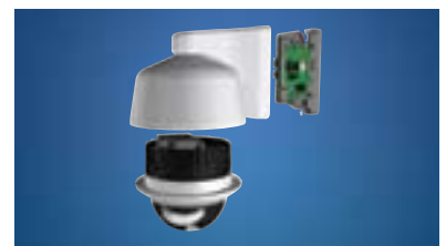
Translator Boards for Third Party Integration