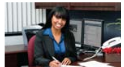
Fanatical Customer Service

It all starts with a relentless commitment to Fanatical Customer Service. Each and every person at Pelco will stop at nothing to ensure that our customers are completely satisfied each and every time. Just ask anyone who has ever worked with us. Stringent design, engineering and testing certifications ensure that your next Pelco purchase will deliver the performance that you and your installation demand.