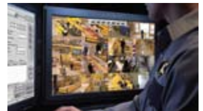
Control External Multiplexers

Direct interface to many well-known multiplexers allows operators to control external multiplexers from the systems keyboard. Simple icons guide the user through the multiplexer's functions such as Full-screen, Quad, 9-view, and 16-view displays.