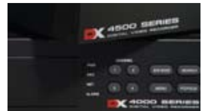
Operate DVR Functions

Control over DVRs can be accomplished directly from System 9760 Keyboards using the DVR management option. Easy to follow icons permit access to suitable DVR functions such as: Play, Record, Fast Forward, Pause, Eject and Stop. Operators need not move from their station or individually operate multiple devices. Control over the entire system is centralized at the system keyboard and also includes built-in video loss detection and system diagnostic features.