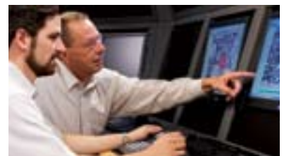
Simple Operation Minimizes Training