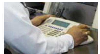
Enjoy Smooth Camera Operation

For smooth and reliable operation of cameras, pan/tilt devices, and dome systems, the System 9760 keyboard makes use of a vector-solving, variable-speed joystick that responds quickly and accurately to an operator's every request. This intelligent interface allows for the remote positioning of cameras to occur in either straightforward or diagonal directions and can vary the speed of remote positioning devices for tracking purposes.